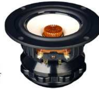
4" PAPER FULL RANGE